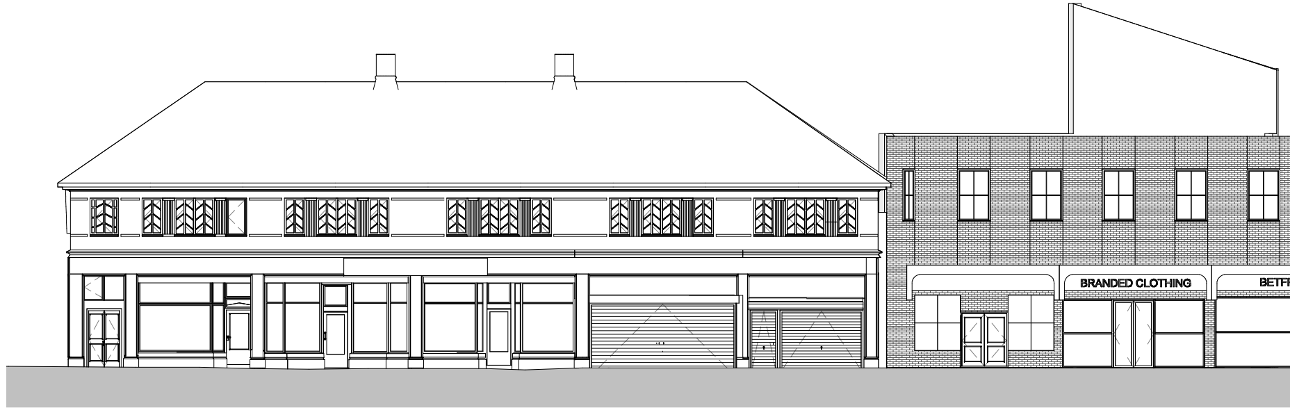
1 PBX_Existing Elevation AA 1 : 200

DO NOT SCALE. ONLY USE FIGURED DIMENSIONS. SHOULD ANY DISCREPANCIES BE FOUND WITH THIS DRAWING, PLEASE INFORM THIS OFFICE. COPYRIGHT OF THIS DRAWING IS OWNED BY JMARCHITECTS.