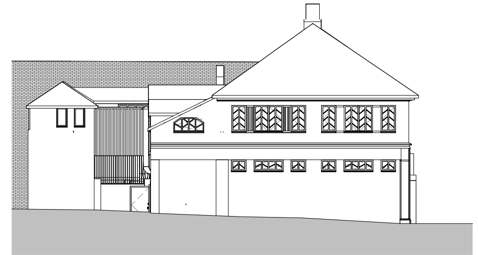
2 PBX_Existing Elevation BB 1 : 200